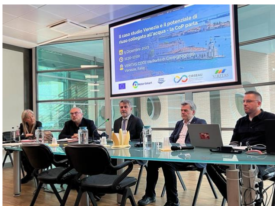
Public B-WaterSmart event in Venice in 2023

Economic Impact: An economic impact was realized through the development of two Decision Support System (DSS) platforms. These platforms reduce freshwater use, enhance water-use efficiency, increase water reuse, and quantify potential negative impacts of overexploitation. The deployment of the DSS also facilitates the identification of incentive schemes and promotes knowledge sharing. There is also a new, general potential for cost adjustments in concessions, the facilitation of governance actions through evidence-based solutions, and additional investments driven by the attention brought to the Fusina site by the B-WaterSmart project. These contributions align with the project's sustainable water use and resource management goals.