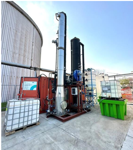
Nitrogen Recovery Pilot Plant

concentrated streams of WWTPs. The selection is based on the need to explore and demonstrate the convenience and feasibility of recovering the valuable resource nitrogen. By addressing this specific aspect, the technologies contribute to sustainable nitrogen management in the wastewater sector and a possible carbon footprint reduction for the overall system.