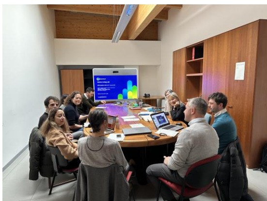
Meeting at the Living Lab in Venice

In the Venice Living Lab the application of resource recovery and circular economy in the field of water, especially wastewater, are strategic to achieve climate change resilience. Currently, the pursuit of these goals is slowed and prevented due to several issues (technical but mainly regulatory) related to wastewater process management. The limits and slowdowns are also linked to a lack of shared and transparent knowledge on the quality and opportunities connected to water reuse and to an over-evaluation of risks, which leads to low social acceptance. Therefore, there are several goals for Venice: