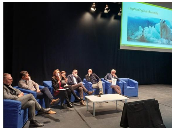
Public B-WaterSmart event in Venice in 2023

Environmental impact: Treated wastewater industrial use increases by 29% (reused water/supplied water) and globally the reuse of treated effluent increases by 32% (reused/total treated). At the nitrogen level, both, the Sludge IT tool and the ammonia stripping technology, support the recovery of nitrogen as fertilizer, under a traceable guarantee of safety. The total recovery potential is low compared to the total nitrogen applied in agriculture at the regional level (<2%) but it implies the complete exploitation of sludge potential, and it allows a significant reduction of carbon footprint linked to mineral fertilizers production and wastewater treatment plants.